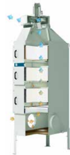
This picture illustrates the drainage process in our FibreDrain® filters.

The airstream enters at the bottom of the filter unit and passes upward through the filter cartridges. The filter stack is progressive in filtration properties, which means that the smaller the particle, the further it will penetrate the filters in the air flow direction. The captured mist drains from the filter surface by gravity down in the sump of the collector.