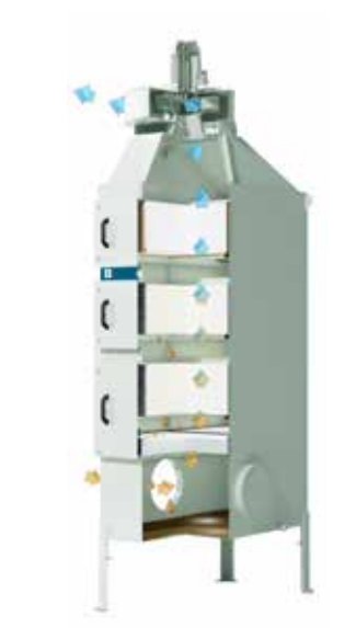
This picture illustrates the drainage process in our FibreDrain® filters.

The airstream enters at the bottom of the filter unit and passes upward through the filter cartridges. The filter stack is progressive in filtration properties, which means that the smaller the particle, the further it will penetrate the filters in the air flow direction. The captured mist drains from the filter surface by gravity down in the sump of the collector.