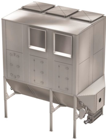
Example: NFKZ3000 2+1 HJ filter with side and top venting for St2 dust

Baghouse dust collector suitable for handling large volumes of air with heavy material contamination levels.