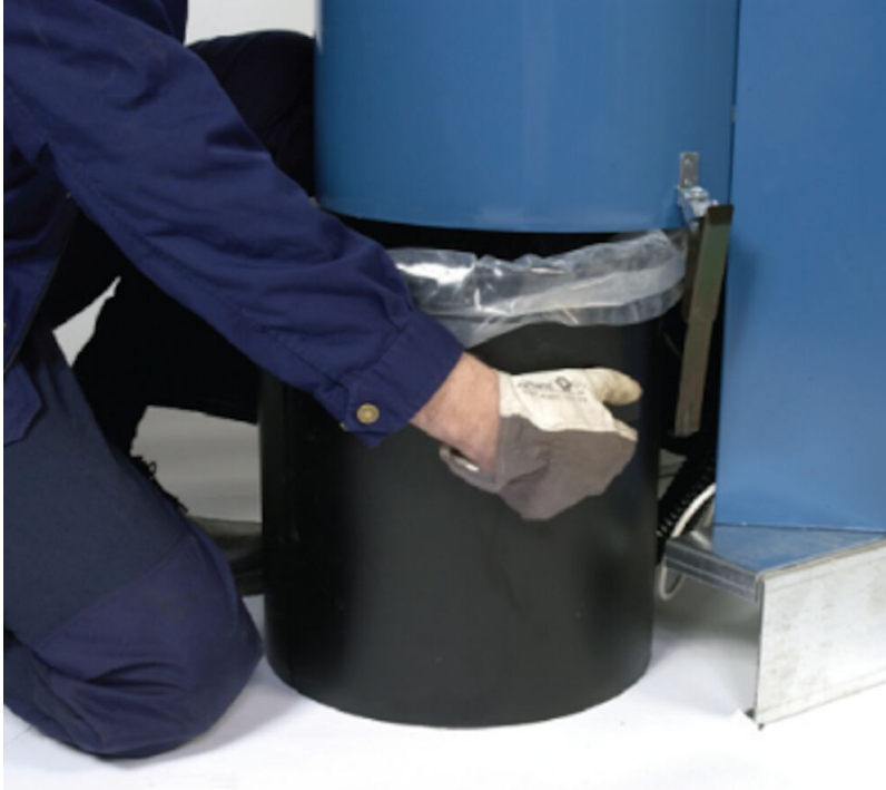
The plastic bin liner is easy to change